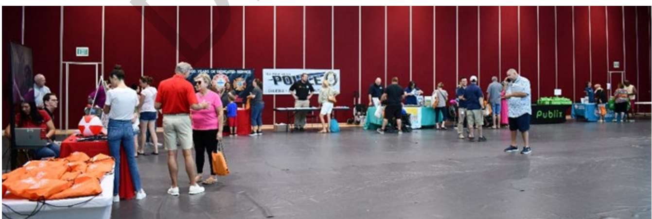
Figure 8: 2024 New Port Richey Hurricane Expo

Hurricane & Flood Expo – The City will host an annual Hurricane & Flood Expo. This will be open to the public and host numerous city departments, state and federal agencies and private organizations. The event will include booths that will communicate, demonstrate, and provide handouts on emergency response, flooding, insurance, utilities, construction, realty, and more.