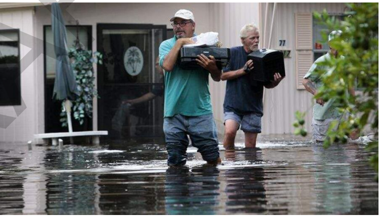
Figure 5: Residents of Imperial MHP after Hurricane Debby 2012

Due to their construction, mobile homes pose a tremendous risk to inhabitants in times of rising flood waters. Electrical systems can fail, leaving residents without power or possibly electrify standing water. Their framing can also begin to fail with enough prolonged inundation. These residents can often have financial hardships and may have difficulty finding refuge in times of emergency and often choose to ride-itout.