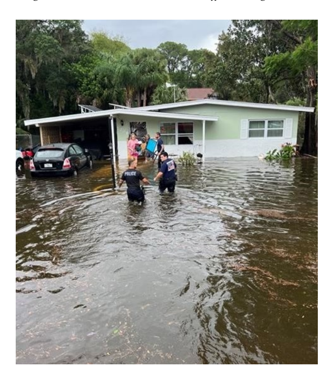
Figure 1: Hurricane Idalia Rescue Efforts August 2023